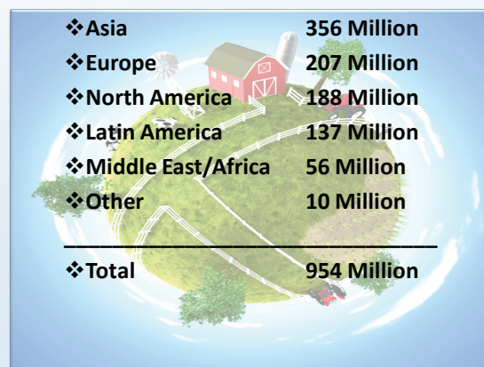
Average Feed Tonnage per Million

Asia continues to be the world's leading feed producing region at 356 million tons. One region, however, exceeded Asia in percent growth over 2011 results. Africa was found to be the fastest growing area in terms of tons of feed manufactured, increasing its tonnage 19 percent from 47 million in 2011 to 56 million in 2012. The Middle East was estimated to have the largest feed mills, with an average of more than 63,000 tons produced per mill.